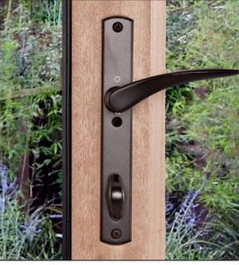
RODOS MULTI-POINT HANDLE BRONZE