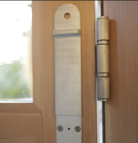
PULL HANDLE STAINLESS STEEL