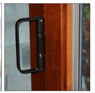
PULL HANDLE BRONZE