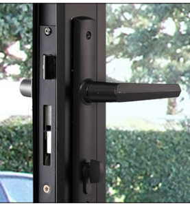
ARIA MULTI-POINT HANDLE BRONZE