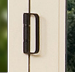
PULL HANDLE BRONZE

DUAL GLAZED TEMPERED GLASS IS STANDARD ON ALL Lacantina DOOR SYSTEMS. FOR BETTER ENERGY PERFORMANCE, WE FEATURE CARDINAL'S LOE GLASS INCLUDING LOE-272 AND LOE-366.