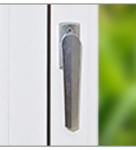
TWIN BOLT LEVER STAINLESS STEEL